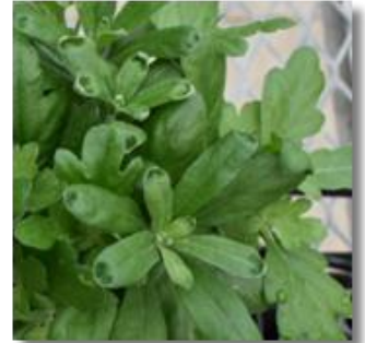
Fig. 1. Crown buds surrounded by non-lobed leaves.

The identifiable feature of crown buds is a change in leaf morphology from lobed leaves to non-lobed leaves, otherwise known as strap leaves (Fig. 1).